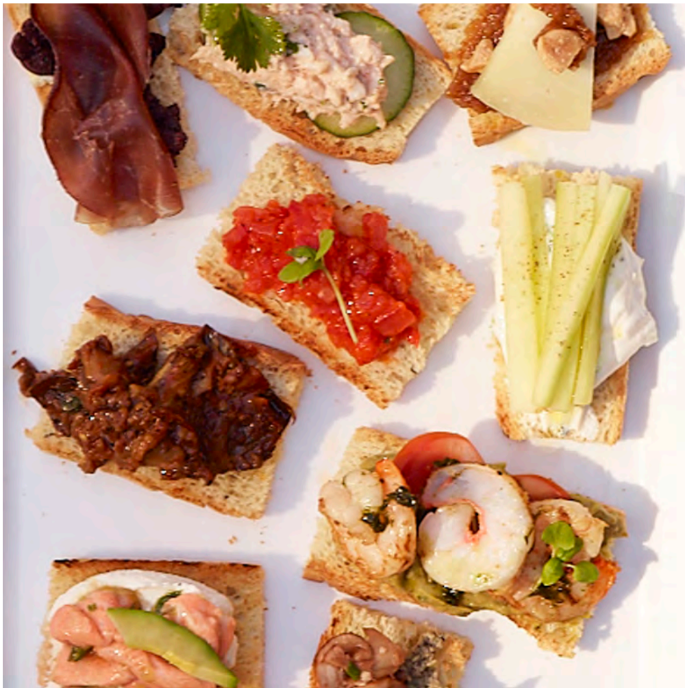
FIG & OLIVE is about passion for the best olive oils, flavors and cuisine from the Riviera & Coastal regions of the South of France, Italy and Spain. Our large variety of extra virgin olive oils was selected to be paired with each dish and to be offered for tasting at the beginning of each meal.